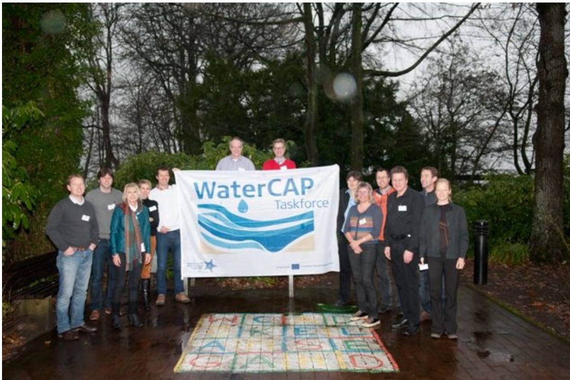
New flag for the MTTF Meetings

It is suggested that each partner announces his / her MTTF about a month before the meeting, and presents a short report (200 words) just after the meeting. This would keep our webpage rather busy.